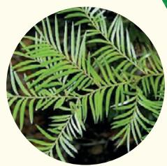
MIRO ( Prumnopitys ferruginea )