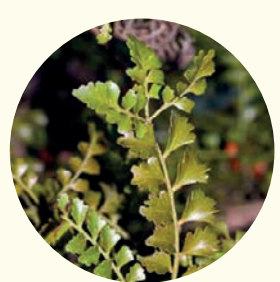
TĀNEKAHA ( Phyllocladus trichomanoides )