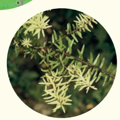
TŌTARA ( Podocarpus totara )

Find out more: visit tiakitamakimakaurau.nz