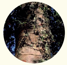
KAURI ( Agathis australis )