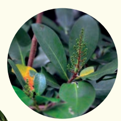
KARAKA ( Coynocarpus laevigatus )