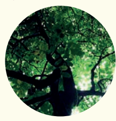
KOHEKOHE ( Didymocheton spectabilis )