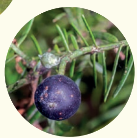
MATAĪ ( Prumnopitys taxifolia )