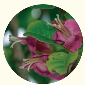
PŪRIRI ( Vitex lucens )