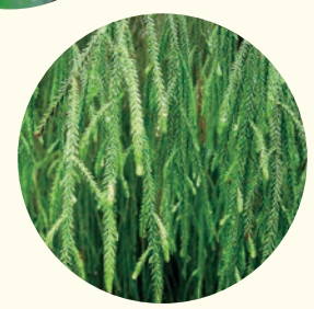
RIMU ( Dacrydium cupressinum )