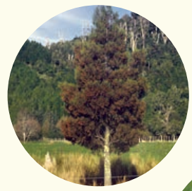
KAHIKATEA ( Dacrycarpus dacrydioides )