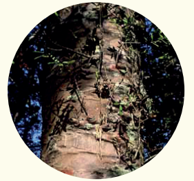
KAURI ( Agathis australis )