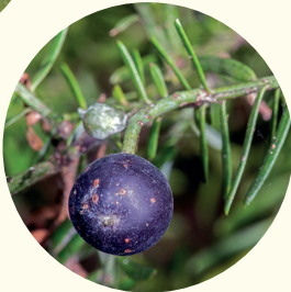
MĀTAI ( Prumnopitys taxifolia )