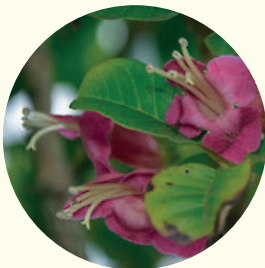
PŪRIRI ( Vitex lucens )