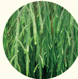
RIMU ( Dacrydium cupressinum )