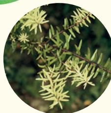
TŌTARA ( Podocarpus totara )