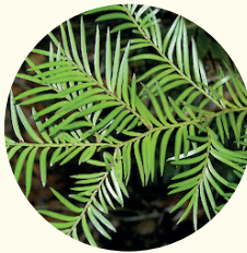
MIRO ( Prumnopitys ferruginea )