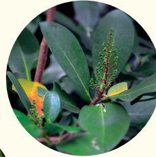
KARAKA ( Coynocarpus laevigatus )