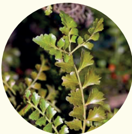
TĀNEKAHA ( Phyllocladus trichomanoides )