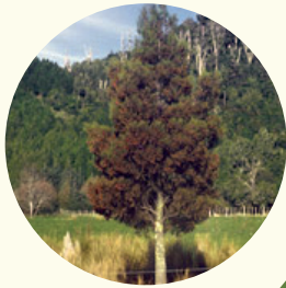
KAHIKATEA ( Dacrycarpus dacrydioides )