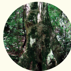
PUKATEA ( Laurelia novae-zelandiae )