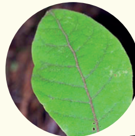
TARAIRE ( Beilschmiedia tarairi )